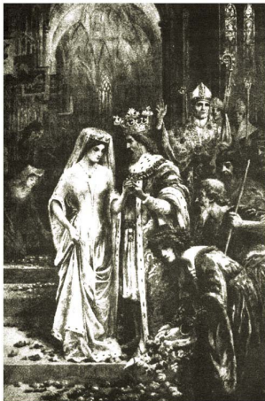
The Marriage of King Arthur